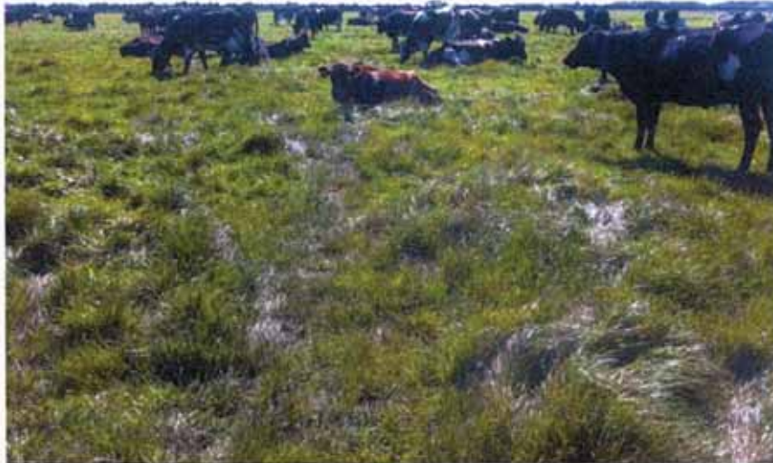
Fig 4. Fistulated cows on pasture research at Lincoln University Dairy Farm

government P21 research programme looking at dairy system studies to reduce nitrate leaching and effect on the production.