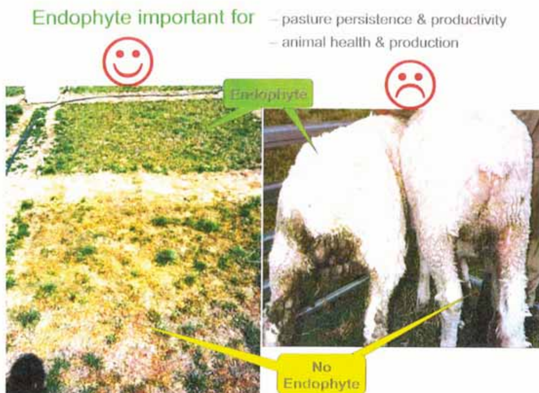
Fig 5. The effect of endophytes on ryegrass pasture and sheep

Endophytes are fungal microbes that live in the tissues of many groups of plants, including grasses. The endophytic association are responsible for some debilitating animal diseases. However, it has also been shown that they are critical for plants' protection against insect pests.