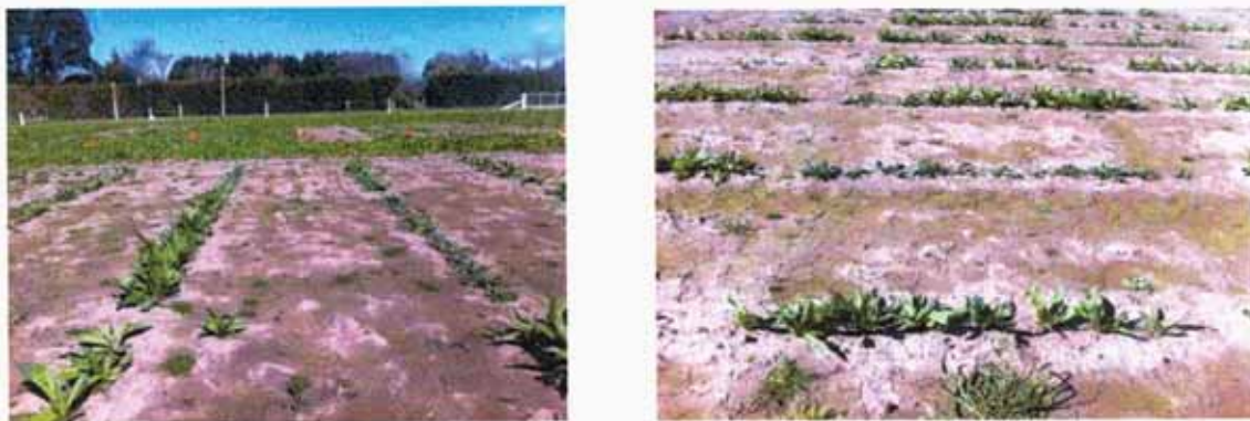
Fig 6: Plantain germplasm evaluation rows

Forage brassica, chicory and plantain are used throughout NZ to enhance nutritive value and also provide winter forage when grass growth slows dramatically. PGGWS through mutation breeding have produced kale cultivars resistant to herbicides. Plantain germplasm is being evaluated and has shown great variation in winter dormant types. Fig 5 shows evaluation rows of plantain with varying growth during the winter