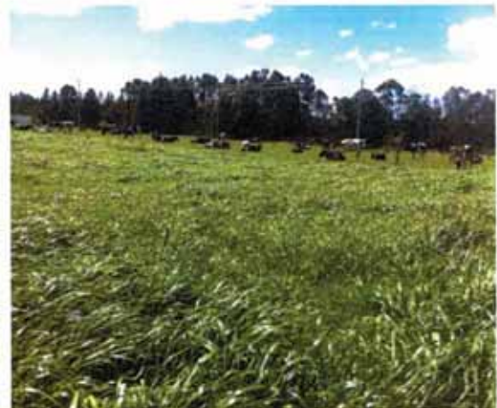
Fig 7. LPC housing and exercise area and University of Sydney Dairy Unit grazing

University of Sydney's dairy farm near by is a contrast with 75ha grazing platform for 350 Holstein cows. The farm had just recently completed an industry-funded Future Dairy 2 project. The emphasis on the system was to maximise milk from grass and forages with minimal purchased feeds. Fig 6 shows the dairy feeding systems operating within Australia. Future Dairy project was covering the largest sector within dairy systems of Australia. 100 cows using 21ha ( 65% Pennisetum clandestinum or kikuyu pasture over sown annually with ryegrass and 35% other forage crops to complement the soil and the animal e.g. peas, oats, maize) and purchasing over 1t grain based concentrates/cow/yr on all year round calving. Over