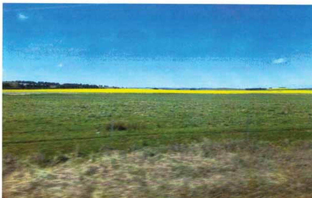
Fig 10. Serrated tussock grass ( Nassella trichotoma ) intrusion in a native pasture

unpalatable to stock. Its control is made difficult as native species are susceptible to the chemical needed to eradicate the serrated tussock grass. Spot spraying to help minimise its spread is time consuming, with Evandale stating 3 days per week and approximately £30000 annually for costs of spray and labour. Evandale has introduced a rotation of forage crops in order to allow those pastures with excessive serrated tussock to be blanket sprayed and cultivated to reduce the seed bank. Much work has been undertaken by Department of Primary Industries to help understand the effects of this grass and mechanisms to control it.