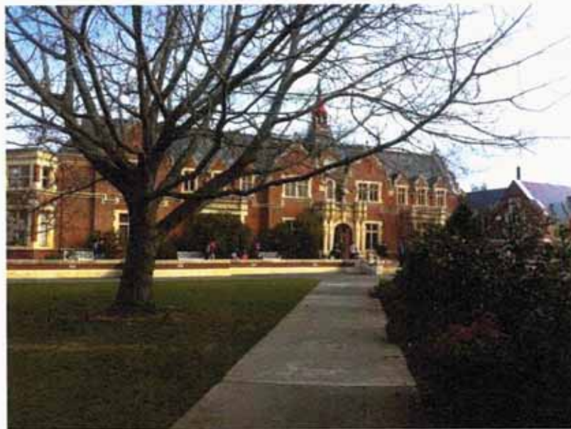
Fig 3. Lincoln University Campus

Lincoln University refers itself as the only specialist university in NZ. It is much smaller than Massey with 4500 student body offering courses in Agriculture, Horticulture, Environment, Tourism, and Commerce. Lincoln has recently merged with Telford Rural Polytechnic who run lower level one year practical courses for 15 yr olds in dairy, sheep and deer (similar to our FE colleges) which makes Lincoln University very comparable to SRUC in both course provision and level.