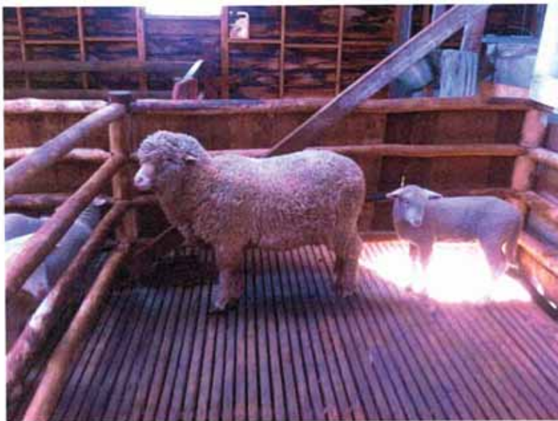
Fig 9. A Merino ewe with her merinoxwhite suffolk lamb

A visit to Evandale estate showed the difficulties of sheep production in this area for both meat and wool. Evandale is owned by a Sydney based businessman with a farm manager left on site to run the 600ha carrying 600 Merino cross ewes and 100 Angus cows crossed to Simmental Bull. Pastures are perennial comprising Cocksfoot ( Dactylis glomerata ), Phalaris sp and subterranean clover ( Trifolium subterraneum ). Approx. 40ha of other forage is planted to supplement spring grazing for freshly calved cows or lambing ewes. This could be Italian ryegrass or triticale.