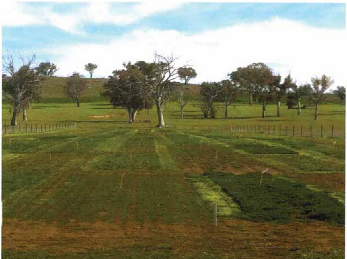
Fig 11. Alternative legume trial

At third element of the trials was to evaluate alternative legumes with varying Phosphate applications. Perennial legumes were: Lucerne ( Medicago sativa L.) Birdsfoot trefoil ( Lotus corniculatus ), Tedera ( Bituminaria bituminosa ), Caucasian Clover ( Trifolium ambiguum ) and annual Legumes: Subterranean clover ( Trifolium subterraneum ), Rose clover ( Trifolium hirtum ) and Yellow serradella ( Ornithopus compressus )