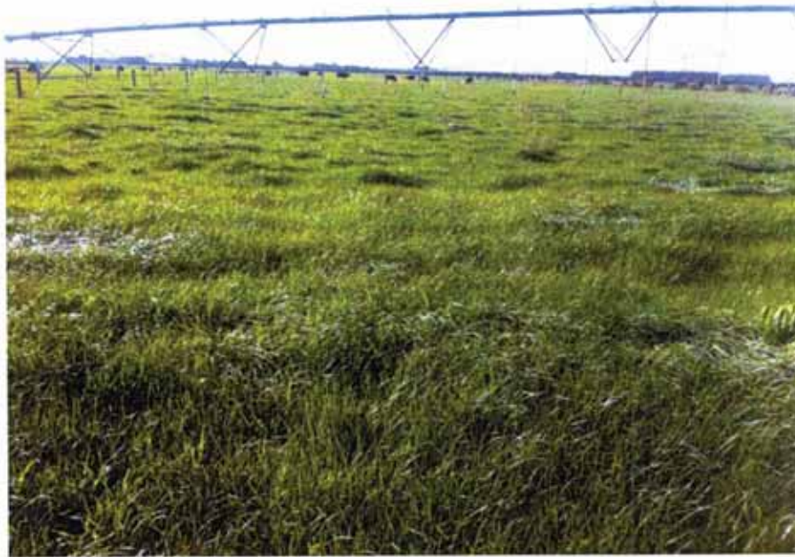
Fig 1. Irrigated perennial ryegrass pasture in NZ

Fonterra (the largest co-operative dealing with 89% of NZ milk) has been very successful in achieving a secure and growing market for milk powder to China and the whole dairy industry is much focussed, pulling together to the same end point. Milk contracts are paid on milk solids and the average yield of milk solid per cow has increased to 330kg ( equates to 3,710 litres of milk with 184kg milk fat and 139kg protein) which is an increase of 35% over the last 20 years, with milk solid per hectare nearly quadrupling in that time. To this end the, Jersey Friesian crossbred (42%), Holstein Friesian (37%) and Jersey (12%) breeds are in favour of use. Milk prices have raised three fold in 20 years, currently around $(NZ) 7 per kg, equivalent to 30p/l.